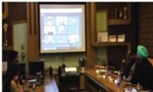
Over 200 Alumni of BVIMIT interacted via Microsoft Teams during the e-Alumni Meet 2021

their batchmates and shared some nostalgic experiences of their association with the reputed institute during their formative academic years. The enthusiasm was infectious as they were all praises for the college,