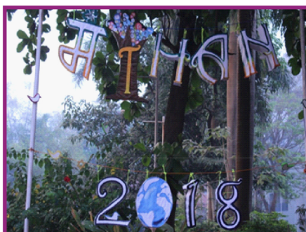
MANTHAN 2018 – Inter Collegiate Event